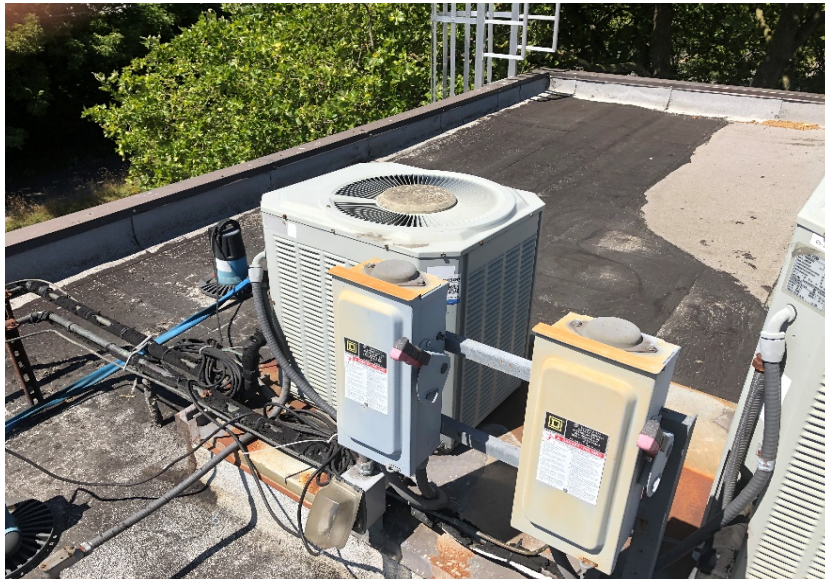
Existing Photos Showing Deteriorated Conditions